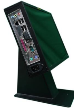
Point of Sale